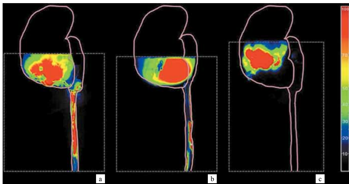
Fig. 1. Projection on a transplant diagram of an intraoperative image of indocyanin green fluorescence of a ureter in semi-quantitative analysis: a – complete and intense fluorescence of the ureter except the last centimeters in favor of good vascularization; b – partial and weak fluorescence of the ureter in favor of weak and partial vascularization; c – zero fluorescence of the ureter and the lower pole of the transplant in favor of no vascularization of the ureter and the lower pole of the transplant. Illustration: H. Boullenois et al. 2020

The authors declare no conflict of interest.